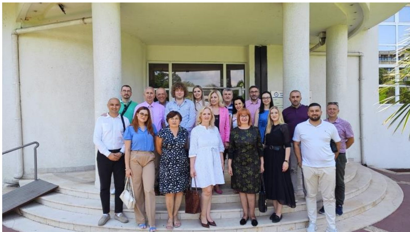
WORKSHOP IN PODGORICA, JUNE 27-28 2023