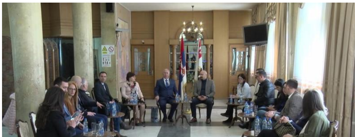
KICK-OFF MEETING, KRAGUJEVAC, SERBIA, FEBRUARY 23-24 2023